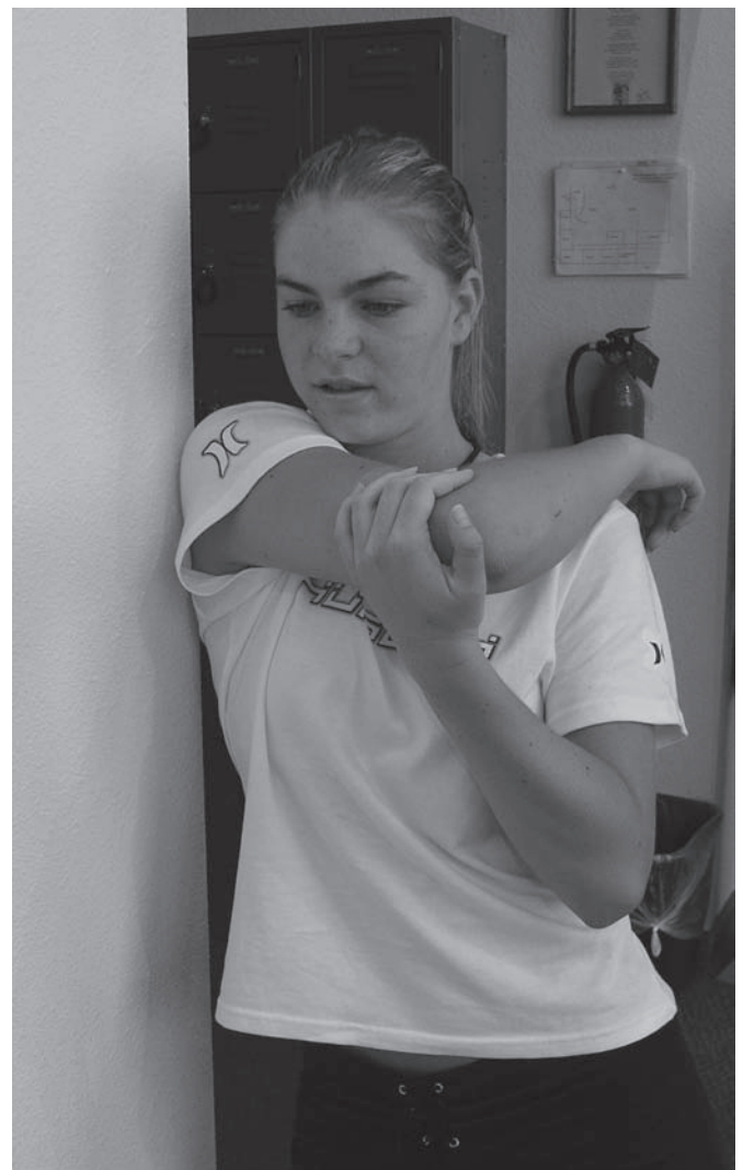
Figure 5 Cross arm stretch using the wall for additional scapular stabilisation to improve internal rotation range of motion.