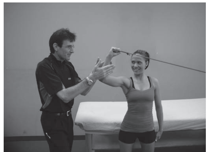
Figure 9 Perturbations applied to the patient's extremity in the 90/90 position using the scapular plane.