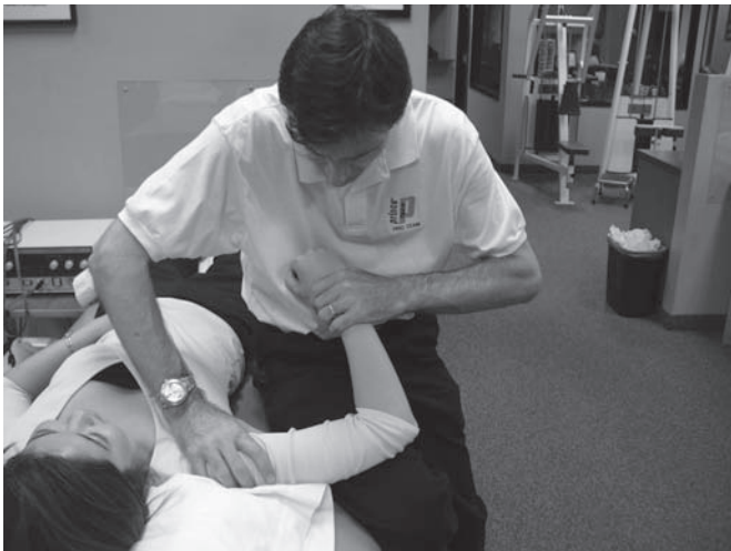
Figure 2 Internal rotation stretch using therapist's leg as a stabilising platform to allow both hands to control glenohumeral internal rotation and utilise the scapular plane.

Scapular dyskinesis is generally characterised by a lack of upward rotation, a lack of posterior tilting and increased internal or medial rotation of the scapula. 38 39 41-44 These changes in scapular kinematics, in the resting position as well as during dynamic arm movements, have been attributed not only to altered recruitment patterns and muscle performance in the scapular stabilising muscles, 38 46-51 but also to flexibility deficits in the soft tissue surrounding the scapula, possibly restricting normal scapular movement during daily activity and sport-specific movements. 12 52-55