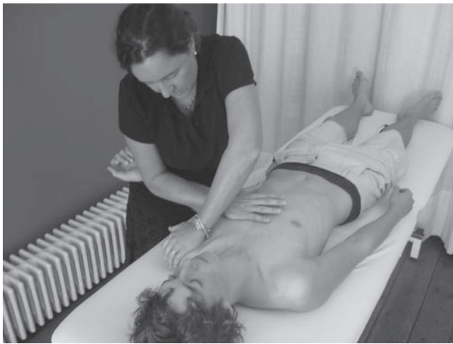
Figure 7 Cools scapular exercise.

showed that patients with impingement benefit from a 4-week motor control training programme to reduce pain and improve function. 72 In summary, there is some preliminary evidence to support the use of conscious muscle control exercises to restore the force-couple activation in the scapular muscles, with special attention to activation of the lower trapezius and serratus anterior.