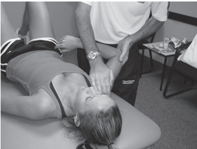
Figure 3 Figure 4 internal rotation stretch. Hand placements allow for containment of humeral translation and scapular compensation.

Several authors have demonstrated altered muscle activity patterns in the scapular muscles in patients with shoulder impingement. These include decreased muscular activity or