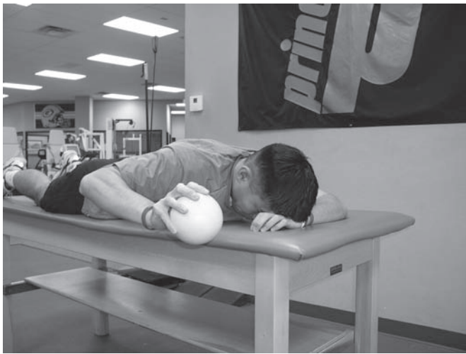
Figure 10 Prone 90/90 plyometric exercise for posterior rotator cuff and scapular training.

period of plyometric and elastic-based rotator cuff exercise in baseball players.