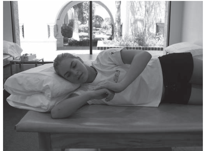
Figure 4 Sleeper stretch used as a home programme activity for patients with limited internal rotation range of motion.

Several authors have demonstrated altered muscle activity patterns in the scapular muscles in patients with shoulder impingement. These include decreased muscular activity or