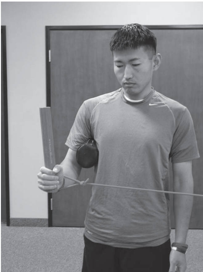
Figure 8 External rotation oscillation.

Finally, the use of isokinetic exercise, initially in the modified base position, which is characterised by the glenohumeral joint elevated 20–30° in the scapular plane position 95 96 and progressing to 90° abducted training, has been shown to increase multiple parameters of muscle function 113 114 and also to improve functional performance. Multiple sets of 15–20 repetitions are applied using the isokinetic dynamometer focusing on faster, more functional contractile velocities (speeds) and using load ranges similar to those used during functional activities. Plyometric exercises for the posterior rotator cuff in overhead athletes are also used in the later stages of rehabilitation in the 90/90 position (figure 10). Descriptive reports of electromyographic activity in the rotator cuff and scapular musculature have demonstrated favourable activation of these important muscles using 0.5 and 1 kg medicine balls, with improvements in both concentric and eccentric rotator cuff strength following an 8-week training